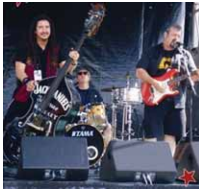
The Recliner Rockers (Auckland)