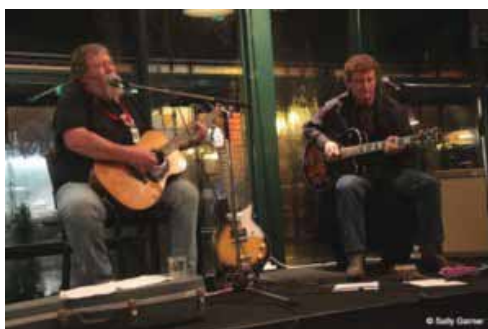
EastSlide Blues (Gisborne)