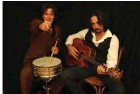
Swamp Thing (Rotorua)