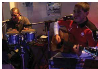
Hammer On (Rotorua)