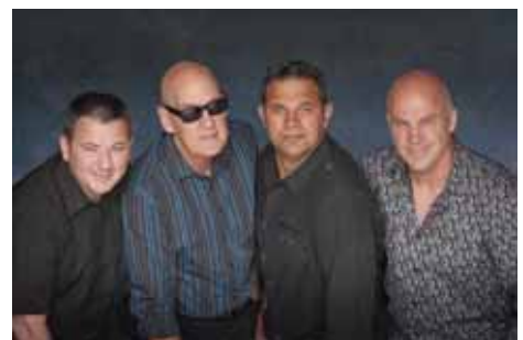
The Flaming Mudcats (Auckland)