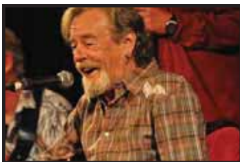
Dutch Tilders MBAS Eternal Patron