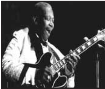
B. B. King MBAS Patron