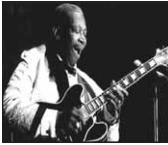
B. B. King MBAS Patron