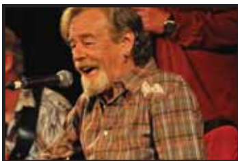
Dutch Tilders MBAS Eternal Patron