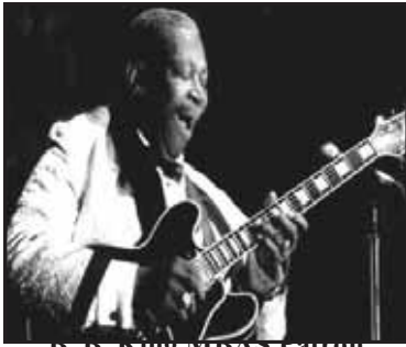
B. B. King MBAS Patron